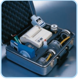
Deluxe Wet Cell Kit with printer