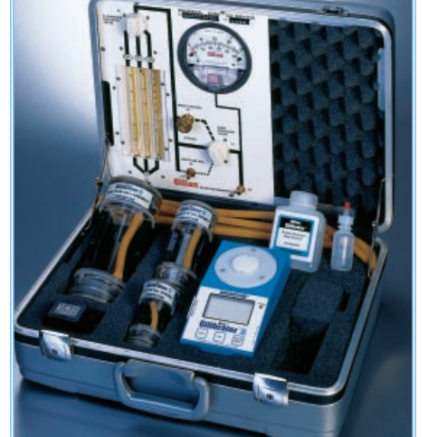
Deluxe Wet Cell Diagnostic Kit