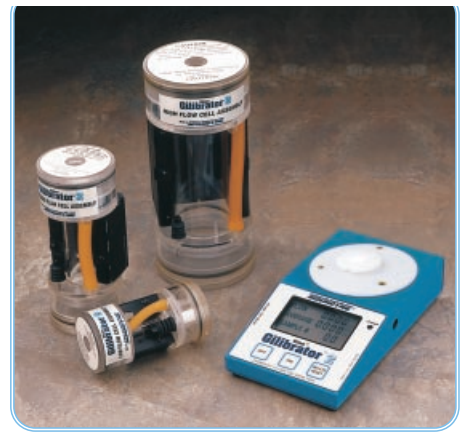
The GILIBRATOR-2® Base can be used with any of three different wet cells.